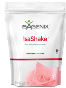
Strawberry Cream (NEW)